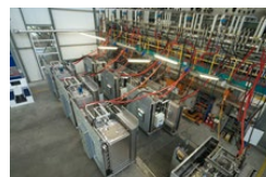
Photo 8: Quality control of sterilizers from Belimed before delivered to customers