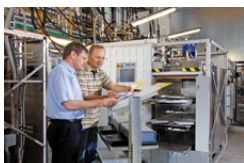
Photo 7: Belimed products for the pharmaceutical industry and laboratories