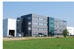
Photo 6: Belimed plant in Grosuplje