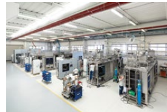
Photo 2: Production for the pharmaceutical industry at the Riese Pio X plant