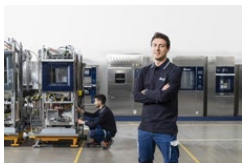
Photo 5: Medical technology for the infection control at hospitals at the Steelco plant in Riese Pio X