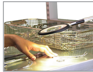
Light Ring Magnifier