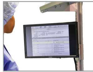
Flat Panel Display Arm