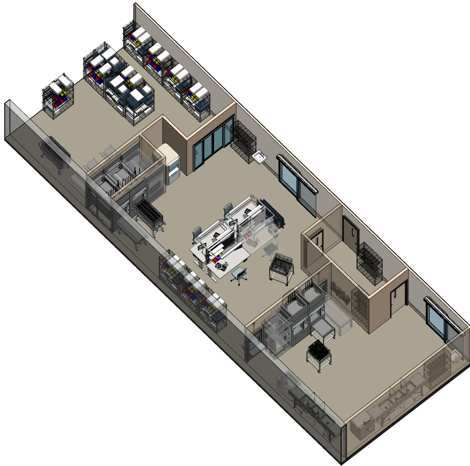
1 ORTHOGRAPHIC VIEW