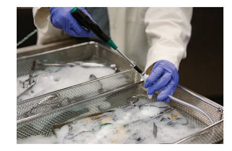
Solution for Cannulated Instruments