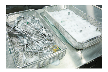
Triple the Coverage