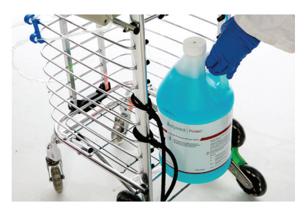
Easy Access Storage